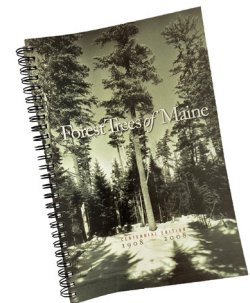
Forest Trees of Maine

These tapes might look like regular measuring tapes, but don't be fooled! One side of the tape has inches, and the other has inches divided by \pi (3.1416). This allows you to wrap the tape around the tree to measure circumference (the distance around the trunk, or around any circle) but to read the diameter (the distance across the trunk or across any circle).