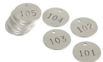
tree ID tags

Make sure you use permanent marker when you mark your wooden plot-center stakes. We want to make sure your markings are as weather-proof as possible.