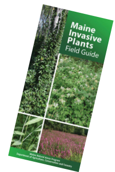
Maine Invasive Plants

This book is published by the Maine Natural Areas Program and describes plants that have been identified as invasive specifically in Maine's ecosystems. Identifying invasive species in your FERN plot can help you better understand the past, present, and future ecosystem dynamics at play. Ask your FERN forestry expert about how invasive species impact their work in the woods.